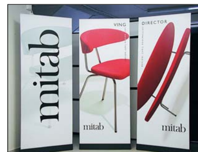
An attractive set-up, in a company showroom, with three 88 cm BannerUp units is a good eye-catcher.

Recognized worldwide and guaranteed for 10 years.