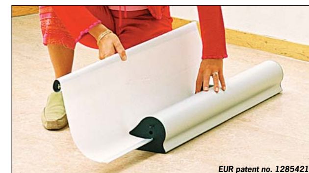
EUR patent no. 1285421

BannerUp Original was developed by Mark Bric in 2000 and is extremely well tested on the market. BannerUp Original has a more robust design and is slightly heavier compared to our new Plus model. Produced in sheet metal and available in anthracite colour. Equipped with hideaway swivel-feet for increased stability if needed.