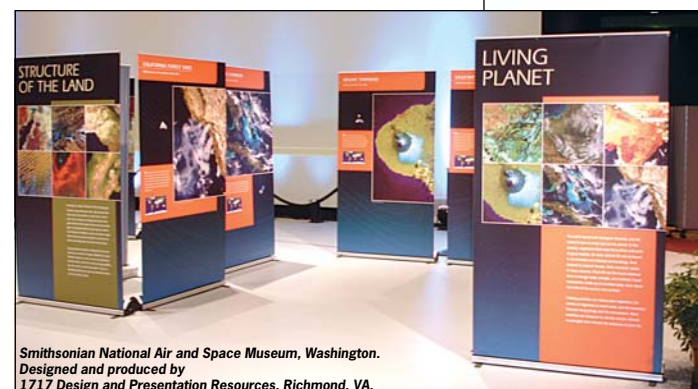
Smithsonian National Air and Space Museum, Washington. Designed and produced by 1717 Design and Presentation Resources, Richmond, VA.

BannerUp is an ideal product at exhibitions, events, conferences and sales promotion campaigns, as well as being a perfect “companion” for sales people on the road. The graphic banner is well protected in the metal cassette